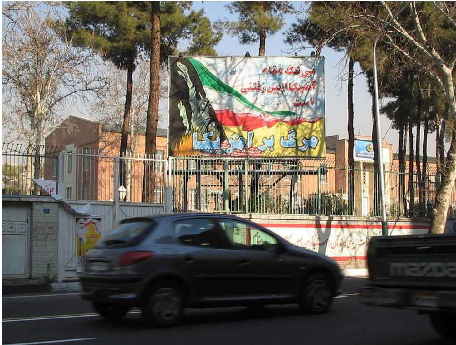
U.S. Embassy seen from Taleghani Avenue in 2005. Banner reads at bottom, "Death to America."