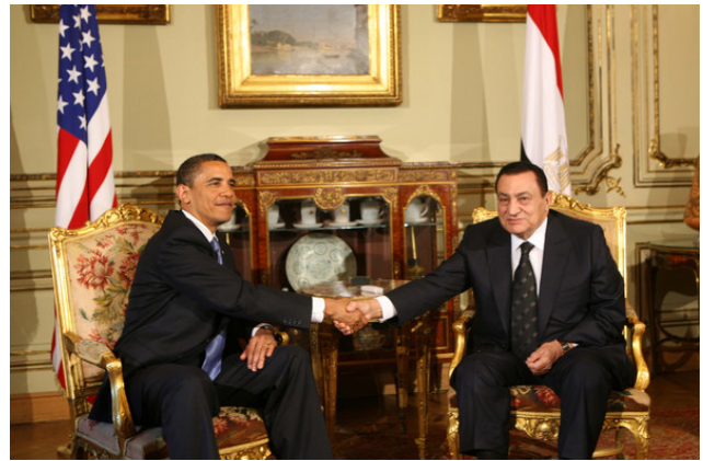
How Fast Things Change - 2009